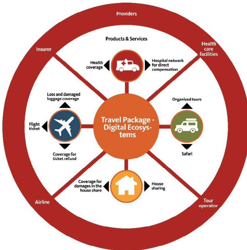
FIGURE 2: EXAMPLE OF ECOSYSTEM